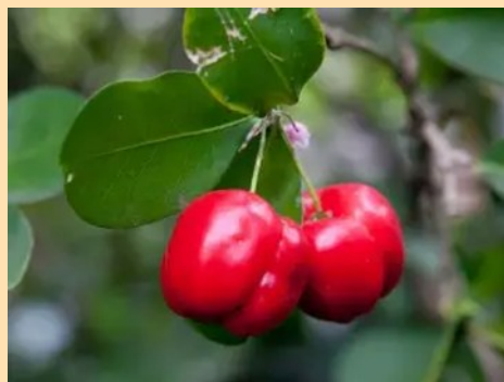
Barbados Cherry