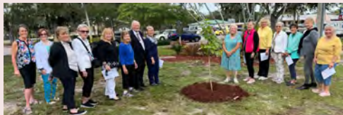
Gulf Coast Garden Club planted an Orange Geiger tree near its Blue Star Marker in the Bonita Springs Riverside Park.