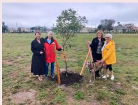
Garden Club of Cape Coral planted Sweet Magnolia Trees trees in each of two separate Cape Coral Parks—Sirenica and Cultural Park.