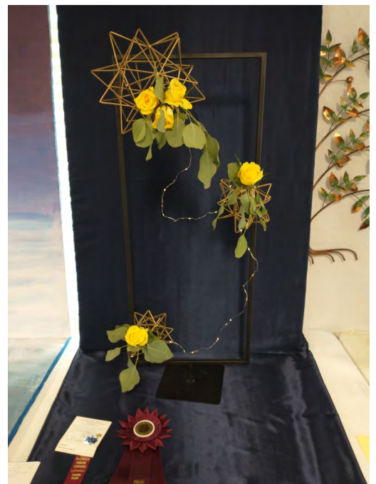
Mercy Abrams - Illuminary People's Choice Design