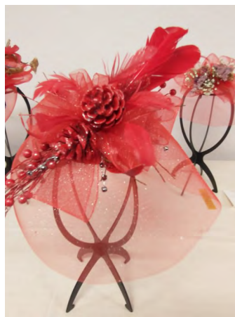
Ena McGrattan Blue ribbon Fascinator