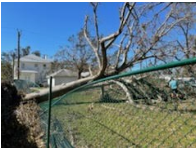
Some of the damage from Hurricane Ian.

Beginning the first week in December and continuing through March, the Berne Davis Botanical Garden will be open from 10:00 am – 1:00 pm on Tuesdays and Thursdays. Docents will be available on Tuesdays, and master gardener volunteers will be there both Tuesdays and Thursdays to answer questions and provide information. We invite you to come take a look as we begin an exciting new chapter at the Berne Davis Garden.