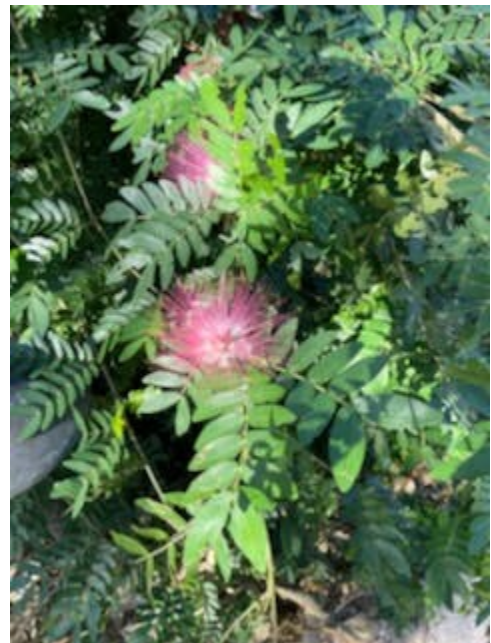
New Hope as the Powder Puff Plant still blooms!