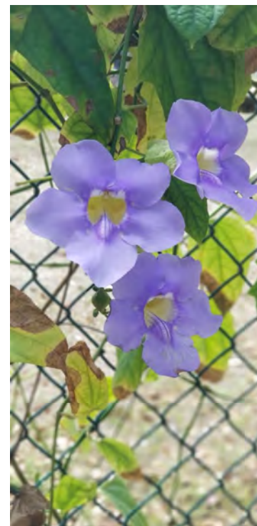
Blue Pea Vine