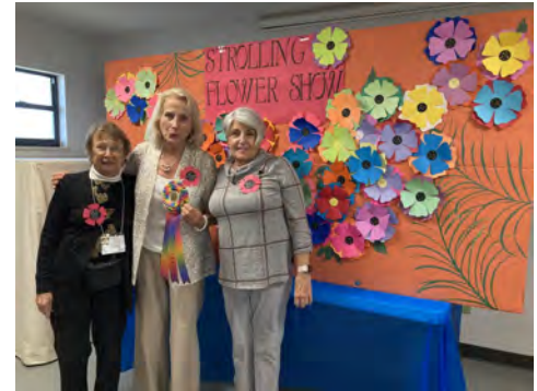
PEOPLE'S CHOICE DESIGNERS

The Strolling Flower Show took place on Friday, February 4 in Downtown Fort Myers in conjunction with Art Walk. There were nine beautiful designs created by groups of talented designers. Designs were in store windows from Friday afternoon thru Sunday afternoon. The general public had the opportunity to vote on a favorite design and the winner was announced at a luncheon held at the Council building. The People's Choice winner was "She's all A Bloom in Downtown Fort Myers" by the Hibiscus Society.