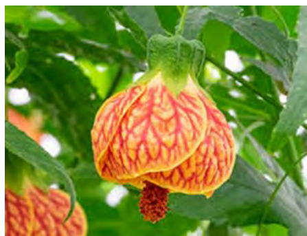
Flowering Maples, Abutilon sp, found at a plant sale