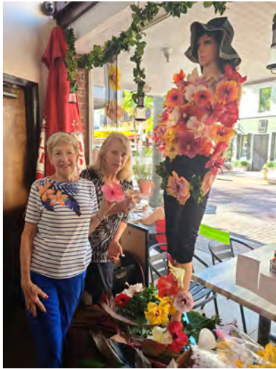
WINNER- PEOPLE'S CHOICE DESIGN