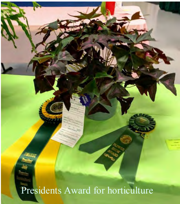
Presidents Award for horticulture