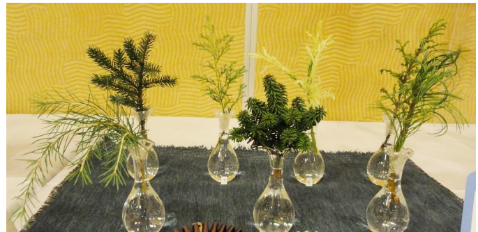
Sample Cut Horticulture entries

"I haven't been everywhere, but it's on my list."