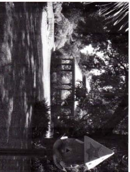
Fort Myers Lee County Council Gardens

Each day concludes with a course review and optional exam. NOTE: Students seeking the National Garden Club designation of Landscape Design Consultant must pay for and pass all exams. To pass each course a student must achieve a grade of 70% or higher. Students, who opt out of the exams will receive a Certificate of Achievement. See About LDS Courses.