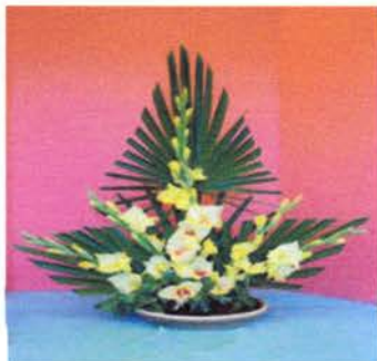
Floral Design Series March-April 2020