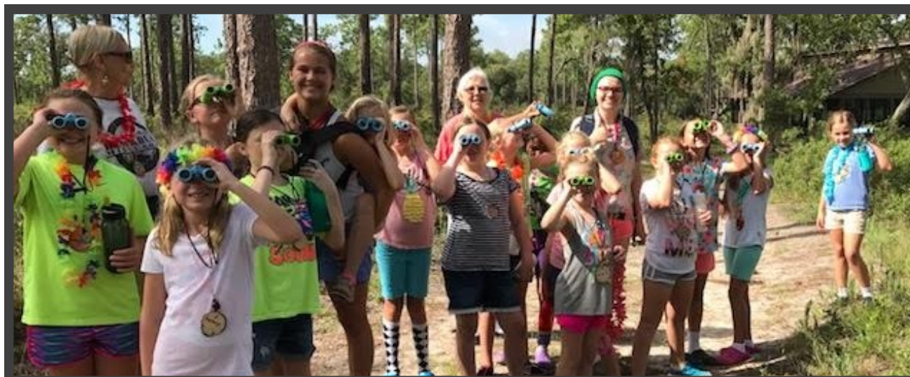
CAMPERS ENJOYING NATURE WITH BINOCULARS