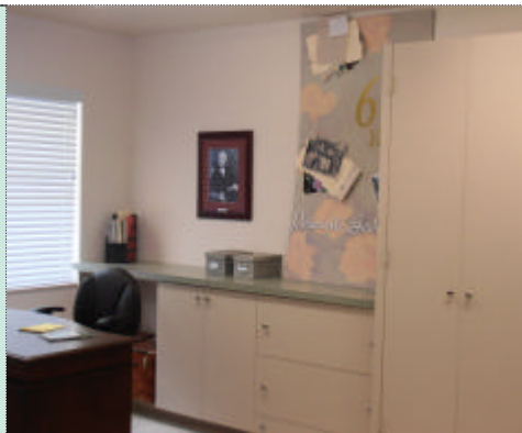
Mina Edison looks over library cabinets

A big THANK-YOU to our handymen Rhey and Joe for their help in getting us organized at the Garden Council headquarters. They began with putting in much needed heavy-duty shelving and tool hooks in the garden storage shed. You can actually walk in there and find something. Next was the additional tall storage cabinet and file drawers and cabinet in the library. Custom built, they look like they have always been there. And finally the broken blinds have all been replaced. We have never looked better.