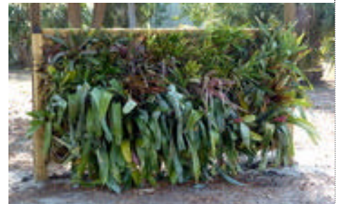
Vertical Bromeliad Garden - plants donated by Wes Higgins, and Pine Island Botanicals , Inc.