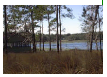
Wekiva Lake at FFGC's Camp Wekiva Wekiwa Springs State Park 1800 Wekiwa Circle Apopka, FL