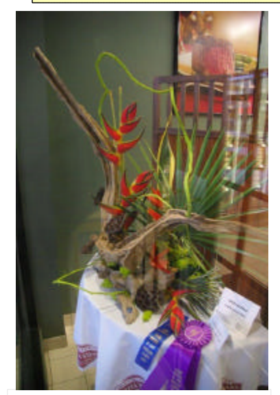
Darlene Tompkins at Omaha Steaks "Steaking Out" History" Violet ribbon for best use of Tropical Flowers