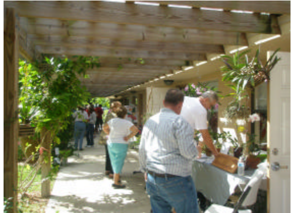
Orchid Society setup under the pergola