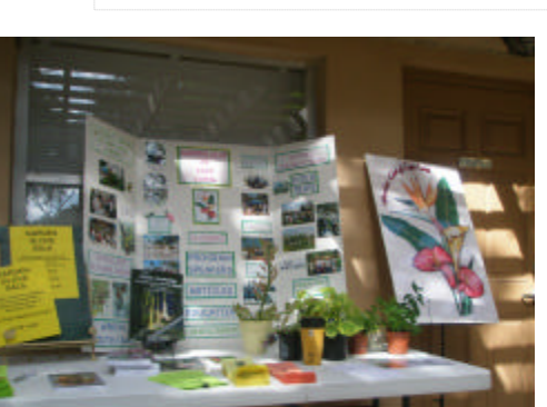
GC of Cape Coral information