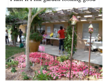
Hibiscus Society answers questions