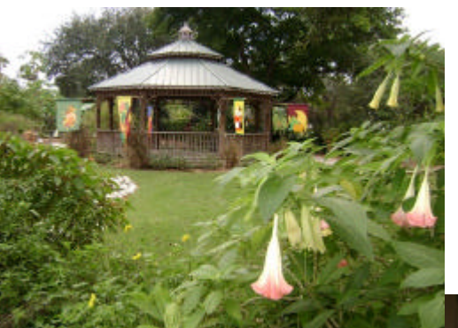
Gazebo with Angel trumpets