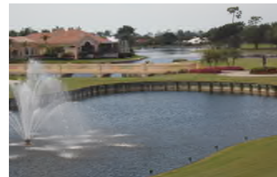
Fiddlesticks Country Club Great view and venue