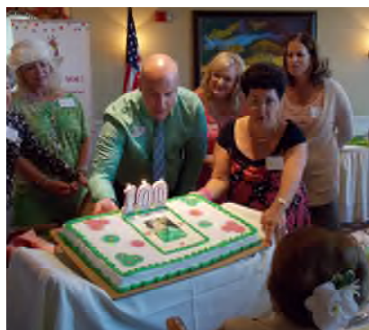
Happy Birthday - Berne