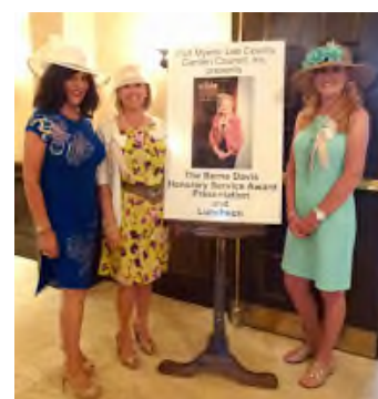
Fiddlesticks GC ladies greet the attendees