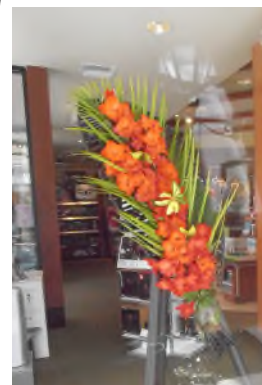
Ellen Chadwick - at Brookstone