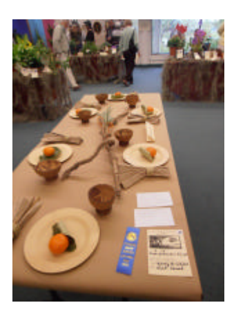
K a t h y E r i c k s o n created this fun functional picnic table for 6 complete with coconut shell bowls.